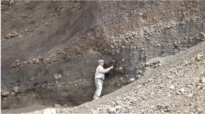
Thick layer of scoria, Dhamar-Rada' volcanic field.

range from 50.20 to 54.60 kg/cm 2 . The total reserves of the scoria deposits are estimated to be about 495 million m 3 .