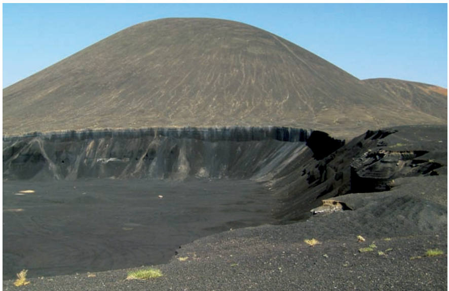
Thick deposit of scoria - Sana'a - Amran Volcanic field.